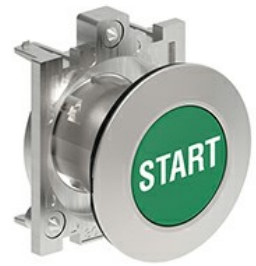
Pushbutton actuators, spring return, with symbol LPFB11