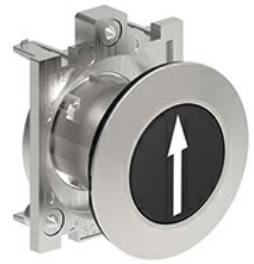
Pushbutton actuators, spring return, with symbol LPFB11