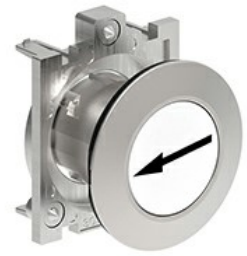
Pushbutton actuators, spring return, with symbol LPFB11