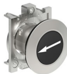
Pushbutton actuators, spring return, with symbol LPFB11