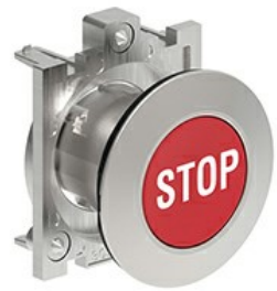
Pushbutton actuators, spring return, with symbol LPFB11