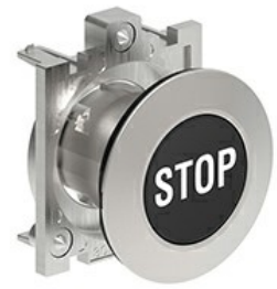
Pushbutton actuators, spring return, with symbol LPFB11