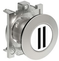
Pushbutton actuators, spring return, with symbol LPFB11