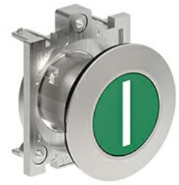
Pushbutton actuators, spring return, with symbol LPFB11