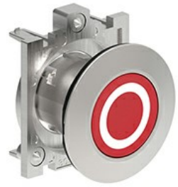
Pushbutton actuators, spring return, with symbol LPFB11