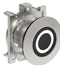
Pushbutton actuators, spring return, with symbol LPFB11