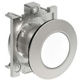
Pushbutton actuator, spring return LPFB10