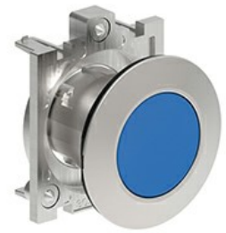
Pushbutton actuator, spring return LPFB10