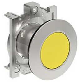
Pushbutton actuator, spring return LPFB10