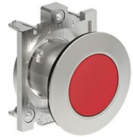
Pushbutton actuator, spring return LPFB10