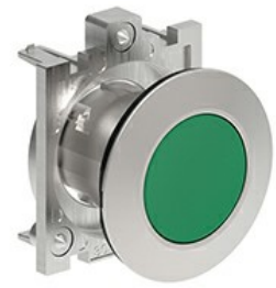
Pushbutton actuator, spring return LPFB10