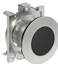
Pushbutton actuator, spring return LPFB10