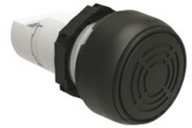
Monoblock buzzer - Continuous or pulse tone LPCZS