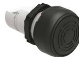
Monoblock buzzer - Continuous or pulse tone LPCZS