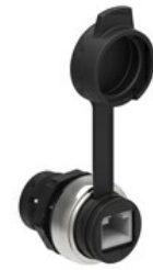
RJ45 interface, Ethernet connection with 1m long cable LPCD0 Cat.5E