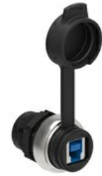
USB interface, B/A female type connection LPCD0