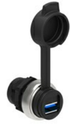
USB interface, A/B female type connection LPCD0