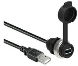
USB interface, A/A female type connection with 1m long cable LPCD0