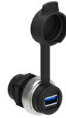
USB interface, A/A female type connection LPCD0