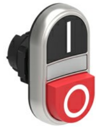
Double-touch actuators, spring return white indicator - One extended and one flush pushbuttons LPCBL72