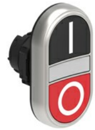
Double-touch actuators, spring return white indicator - Two flush pushbuttons LPCBL71