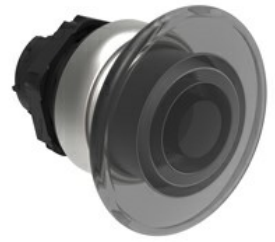
Illuminated mushroom head button actuators - Spring return Ø 40mm/1.6" LPCBL61