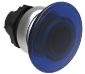
Illuminated mushroom head button actuators - Spring return Ø 40mm/1.6" LPCBL61