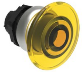
Illuminated mushroom head button actuators - Spring return Ø 40mm/1.6" LPCBL61