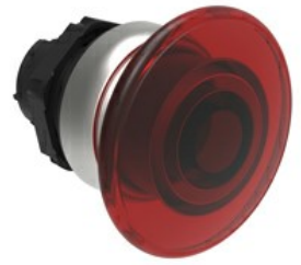
Illuminated mushroom head button actuators - Spring return Ø 40mm/1.6" LPCBL61