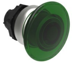
Illuminated mushroom head button actuators - Spring return Ø 40mm/1.6" LPCBL61