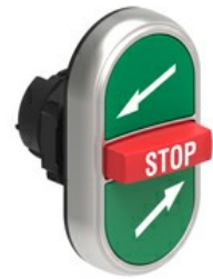
Triple-touch actuators, spring return - One middle extended buttons LPCB73