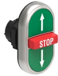
Triple-touch actuators, spring return - One middle extended buttons LPCB73