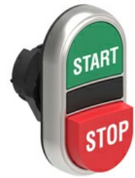
Double-touch actuators, spring return - One extended and one flush pushbuttons LPCB72