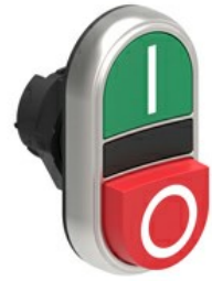
Double-touch actuators, spring return - One extended and one flush pushbuttons LPCB72