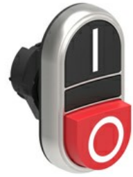
Double-touch actuators, spring return - One extended and one flush pushbuttons LPCB72