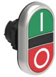
Double-touch actuators, spring return - two flush pushbuttons LPCB71