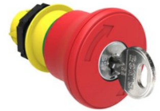
Mushroom head pushbutton, Latch, turn key to release Ø 40mm/1.6" LPCB684