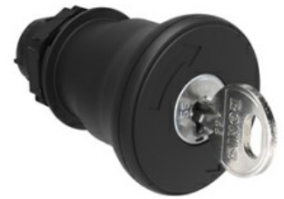
Mushroom head pushbutton, Latch, turn key to release Ø 40mm/1.6" LPCB684