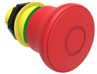
Mushroom head pushbutton, Latch, pull to release Ø 40mm/1.6" LPCB674