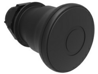
Mushroom head pushbutton, Latch, pull to release Ø 40mm/1.6" LPCB674