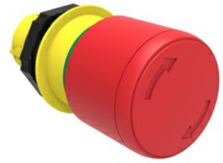
Mushroom head pushbutton, Latch, turn to release Ø 30mm/1.2" LPCB663