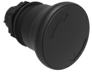
Mushroom head pushbutton, Latch, turn to release Ø 40mm/1.6" LPCB634