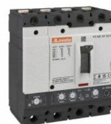
Moulded case circuit breakers P5ME