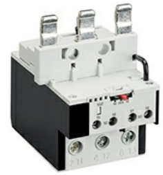
RFNA110 Motor protection relay