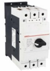
Motor protection circuit breaker SM3R