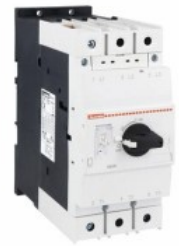
Motor protection circuit breaker SM3R