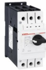
Motor protection circuit breaker SM2R