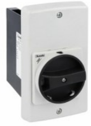
Flush mount enclosures IP65 for SM1R (UL type 4X) SM1Z Flush mount enclosures IP65 for SM1R (UL type 4X) SM1R...