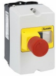
Surface mount enclosures IP65 (4X) for SM1P SM1Z Surface mount enclosures IP65 (4X) for SM1P SM1P...