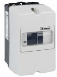
Surface mount enclosures IP65 (4X) for SM1P SM1Z Surface mount enclosures IP65 (4X) for SM1P SM1P...